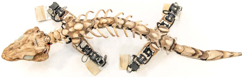
Figure 2. OroBOT (Nyakatura et al. 2019).

Nyakatura and colleagues described their intent; the