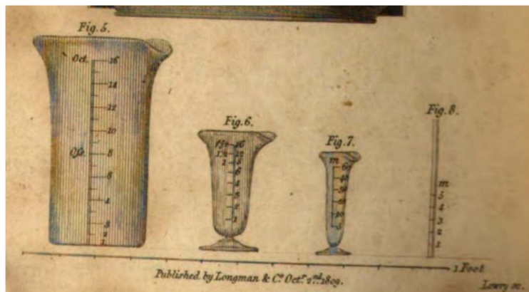
Figure 2. Glass measures, in the 1809 Pharmacopoeia of the Royal College of Physicians of London , p. 452. “Fig. 7” graduated glass measured a fluidrachm in portions of 60, 40, 30, 20, 10, and 5 minims. “Fig. 8” graduated tube measured from 5 minims down to 1.

roduces the term “minim” into their system of measures. The “drop” is purposefully left off of the Pharmacopoeia’s unit conversion table, to avoid confusion and discourage use, as it was found to be “so very variable, that it could not be applicable under any alteration of circumstances, and therefore it seemed better to omit it altogether” (RCPL 1809, p. 7).