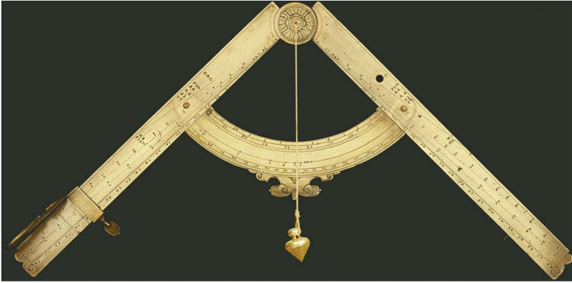
Figure 2. Galileo's compass set up as a gunner's squadra .

operations without understanding them 3 (Favaro 1891, p. 369). The delivery of streamlined mathematical enlightenment to the young aristocrats he tutored was not the book's sole goal, however (Galilei 1890–1909, vol. II, p. 370). Galileo claimed that he had decided to publish the Operazioni after hearing that someone was “preparing himself to appropriate” the instrument: