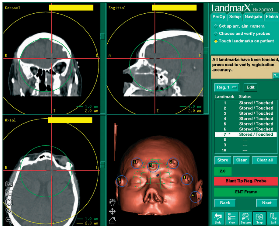
Figure 2 Computed tomography of a patient with both frontoethmoidal and maxillary mucocoeles was transferred to the system computer. The computer software restructured the computed tomography images and displayed them on the screen in different perspectives (axial, bottom left; coronal, top left; sagittal, top right; three dimensional model, bottom right). After the process of “co-registration” green and yellow circles illustrated the regions within which the localisation error deviated 1 mm or less (green) and 2 mm or less (yellow).