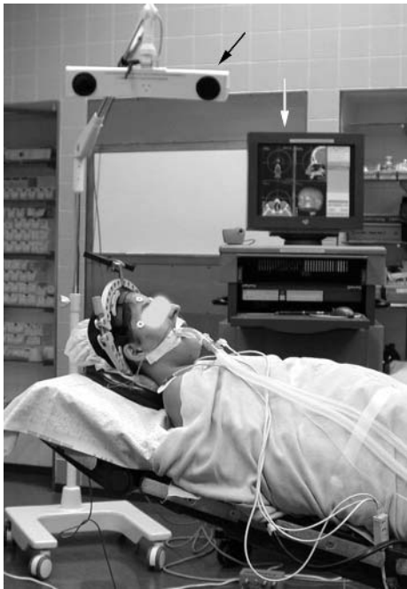
Figure 1 The navigation system includes a monitor and a computer, an optical digitising camera, a reference head frame, and specialised optical probes (not shown).