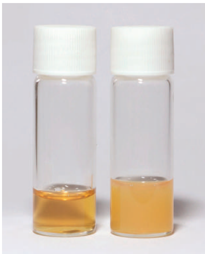
Figure 2 Comparison of patient's serum showing lipaemia (bottle on the right) with a control serum.

A 52 year old woman presented to the emergency department with two hours of central chest pain. She had no past medical history of ischaemic heart disease, diabetes, or hypertension. She had a family history of ischaemic heart disease; her brother had a myocardial infarction when 50 years old. She was taking no medication.