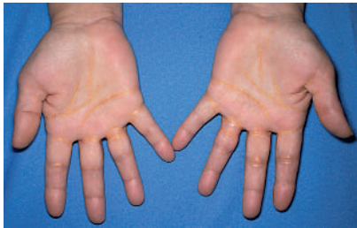
Figure 1 Patient's hands showing palmar striated xanthomas and yellowish discoloration along the palmar creases.