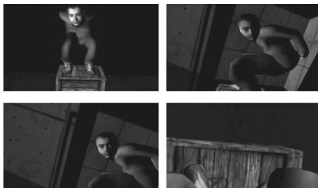
Figure 2. The virtual scene. (a) Top left: The participants at first saw the avatar from a third-person perspective. (b) Top right: After entering into the avatar perspective, they may turn their head to the right and see a reflection in a virtual mirror. (c) Bottom left: As they moved their head, the view would change, and the head of the avatar would move in synchrony. (d) Bottom right: When they looked down at themselves, they would see the virtual knees and feet corresponding to a crouched position.

ments of adjustment, and also for us to check that the belt they wore was correctly sampling their respiration. It was explained that they should move their head freely in all directions but that they must keep their body still. They were also told that they were about to be left alone in the room and that the story was that they were there in that room against their will. At that point, the experience began, with audio accompanying the introduction of the visuals (see Figure 2).