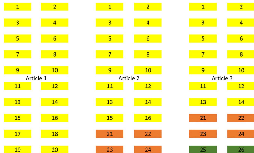
Figure 1. Three articles with partially overlapping authors clustered into one group. Colours indicate authorship overlaps. Although articles 1 and 3 have fewer than 80% authors in common, they both have 80% in common with article 2 and so are grouped into a single cluster.

score for each paper by the world average of all papers published in the same field and year. This avoids advantages for older articles (because they are normalised against contemporary articles) and for high citation fields (because they are normalised against articles from the same field). The log transformation \ln(1 + c) was applied to all citation counts before any calculation to reduce the impact of individual highly cited articles so that (a) the data is less skewed and it is more reasonable to average it with the arithmetic mean and (b) the resulting figure is less subject to variability (Thelwall & Fairclough, 2017). Most articles were in multiple fields and in these cases the arithmetic mean of the values for each field was used.