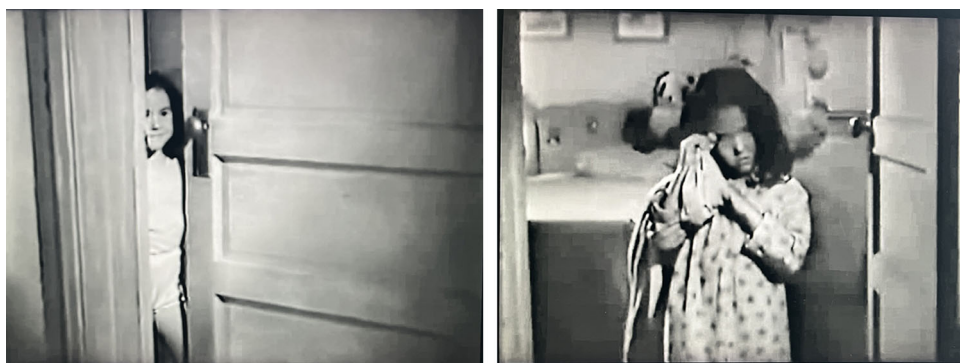
FIGURES 3 and 4. “Are you happy here?”; an unhappy Judy. Stills from “Children of Calamity” or “Question: Where Vanished the Tragic Piper?,” Slattery’s People , season 1, episode 7, 2:45 and 46:26. Directed by Lamont Johnson. Aired November 2, 1964, CBS. Online version available on YouTube: https://www.youtube.com/watch?v=f0I1aOO4JaU .

The episode’s conclusion adds moral complexity to this decision by turning to the adoptee herself. As Judy is about to be taken away by social services, Jimmy’s rifle appears once more, turned this time toward Slattery. But the scene takes a decisive turn when Judy appears, frightened, at her bedroom door. This image echoes our first glimpse of Judy, who, at the episode’s start, peeked shyly from her doorway, smiling and offering confirmation that she’s “happy here” (fig. 3). By the end, however, such happiness has been shattered (fig. 4). Poised at the threshold of private and public, family and the law, these images in the doorway bookend the episode with two fraught tests of seeing the adoptee. In the first, Judy appears proof positive of a well-