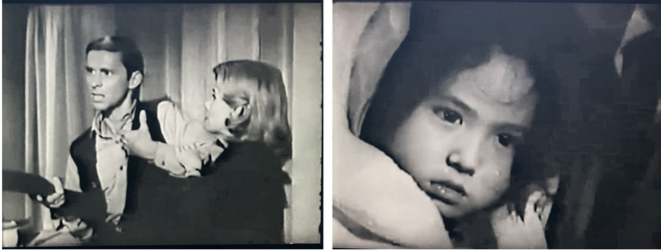
FIGURE 5 and 6. Shot: Jimmy's monologue; reverse shot: Judy's tears, close-up. Stills from "Children of Calamity," Slattery's People , 47:38 and 47:55.

adoption. The question, then, becomes whether these substitutions can ever be stopped or interrupted, and where, exactly, they might end. The episode's final close-up on Judy, now in Slattery's arms, with the rifle sighted-in on her and Slattery alike, raises the question of whether or how its audience can perceive the wounds of the adoptee herself. After Slattery attempts a final appeal to Jimmy's parental instincts, Jimmy begins a wild monologue: "What about me? Oh I'm here, you know. I see and I feel, you know. I look around, I have wants. Yeah, go on. Take the kid. I never wanted her in my house to begin with, you know that." The effect of these words is registered by a shot/reverse shot, the camera switching from Jimmy to a close-up on Judy and back again (figs. 5 and 6). This reverse shot is the show's coup de grâce against the risks of proxy adoption. Though this alternating camera pattern is typically used to establish subjects in conversation with each other, Jimmy is not looking at Judy as he speaks but rather at Slattery, underscoring a fundamental lack of communication between parent and child. This imbalance proves Jimmy once and for all the bad father he's always been. This camerawork establishes the violence inflicted on Judy by her adoption, formally enacting its asymmetries.