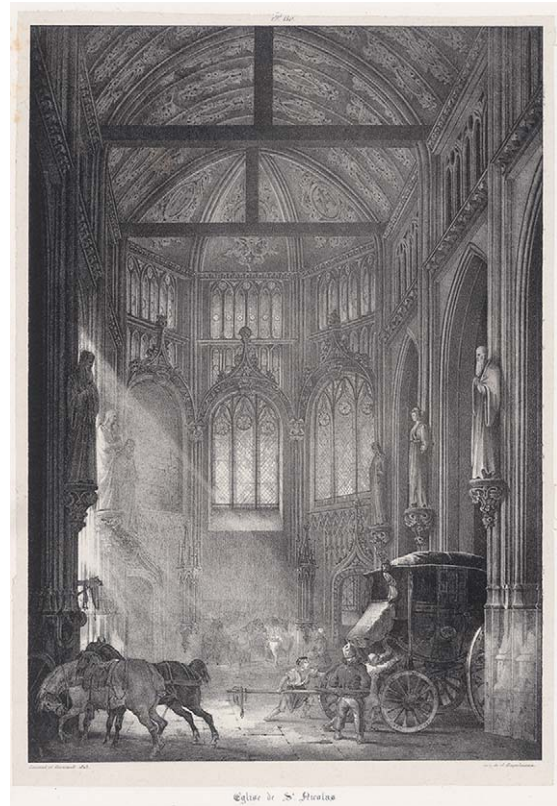
FIGURE 2. Théodore Géricault, Église de Saint-Nicolas , 1824, lithograph, in Voyages pittoresques et Romantiques dans l'ancienne France: Ancienne Normandie , 2:plate 150.