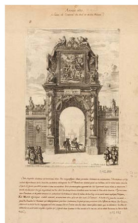
FIGURE 3. Charles-Marie Fevret de Fontette, Recueil d'estampes, desseins, etc. représentant une suite des événements de l'histoire de France, à commencer depuis les Gaulois, jusques et y compris le règne de Louis XV, 1760s–1772, vol. "1660: Entrée Louis XIV." Bibliothèque nationale de France, Paris.

Fevret de Fontette came even closer than Montfaucon to narrating history through images. He also conceived of images as supplementary to historical texts, as Montfaucon did, but he compiled them into the format of a book, one image per page, rather than clustering multiple images on a single sheet to illustrate a theme. This sequence of discreet images, arranged in chronological order (of subjects), created a visual narrative of history. Moreover, the collector designed his elephant-folio volumes to resemble books: he composed and decorated title pages and section pages in imitation of engravings, with titles and dates, legends, and frames all handwritten or drawn to look like the texts and formats included within engravings (fig. 3). This very elaborate bookish presentation of the mounted prints tends to turn them into a kind of visual history of France. A temporality is built into the viewing of these grand in-folio volumes as their pages are turned, creating a visual trajectory of historical events that moves the