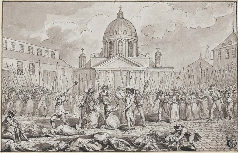
FIGURE 8. Massacre à la Salpêtrière, 3 Septembre 1792 . Pen, gray ink, and wash. Former Collection Rothschild, Paris.

seen and felt in a great event, without digressing and without writing, I wanted this voluminous work, the only one of its kind, to be the control and contestation, so to speak, of our written history, its safety and its embellishment. 56