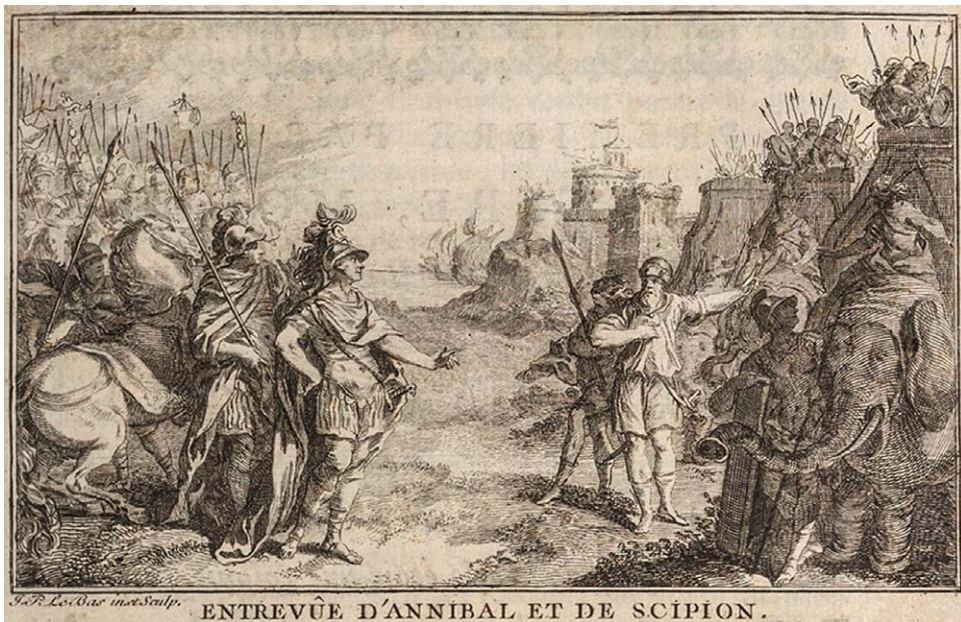
FIGURE 4. Jacques Philippe Lebas, “Entrevûe d’Annibal et de Scipion.” Engraving, 7.81 × 15.6 cm (headpiece) of Charles Rollin, Histoire ancienne des Carthaginois , in Histoire anciennes des Égyptiens, des Carthaginois... (Paris, 1740), 1:101. Bibliothèque nationale de France, Paris.

The figurative illustrations in Rollin reveal a traditional idea of the relationship between “image” and “history” by the literal faithfulness of the image to represent the text. The conventional dependency of images of the past on texts derived from the inevitably prior representation of events in written historical works. Lebas’s Entrevûe d’Hannibal et de Scipion (Interview of Hannibal and Scipio) is a case in point (fig. 4). This vignette