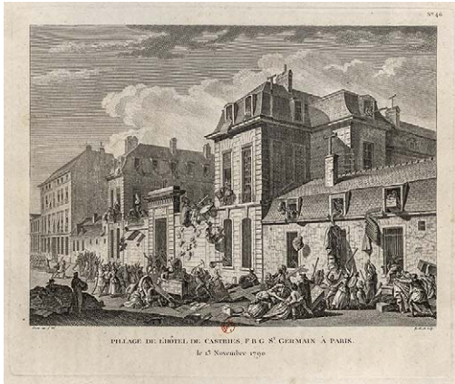
FIGURE 7. Pierre-Gabriel Berthault after Jean-Louis Prieur, “Pillage de l’Hôtel de Castries. Fbg S t . Germain à Paris, le 13 Novembre 1790,” no. 46, from Tableaux historique de la Révolution française ou Analyse des principaux événements qui ont eu lieu en France depuis la transformation des Etats-Généraux en Assemblée nationale, le 20 juin 1789 , Paris, 1791–1817. Bibliothèque nationale de France, Paris.

An unpublished compilation from the same period was Jean Louis Soulavie’s (1752–1813) private collection of images of modern French history, which concentrated sustained attention on the Revolution as part of a longer national history. The extension of the nation’s modern history into the present had already been adumbrated in print collections such as Fevret de Fontette’s, which brought the timeline of French history into that collector’s present, the reign of Louis XV. But those earlier compilations of prints of the past did not conceive of their subjects as a thematically or temporally coherent series, as “the age of —,” to the extent that collections of prints of the French Revolution did.