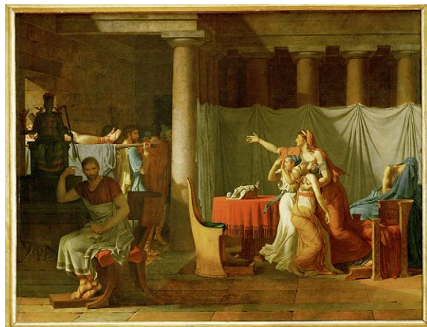
FIGURE 5. Jacques-Louis David, Les Licteurs rapportent à Brutus les corps de ses fils, 1789. Oil on canvas, 323 × 422 cm.

Most history paintings were conceived and executed as stand-alone works of art and rendered their subjects in a single pictorial field (rather than as part of a series). They consequently isolated an event pictorially from a broader narrative, but, since they told familiar stories, a narrative context hovered around the painted scene, which informed viewers would have recalled to mind. Following a method of imagining a historical event that was diametrically opposed to Lebas's "mirroring" of a passage in Rolin's Ancient History , David effectively invented the subjects of his paintings,