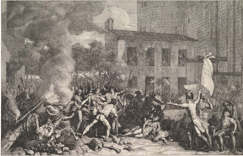
FIGURE 6. Charles Thévenin, Prise de la Bastille , 1790. Etching, 37.3 × 58.3 cm. Bequest of W. Gedney Beatty, Metropolitan Museum of Art, New York.

to the Bastille event. 43 Thévenin “elevated” popular commercial images of that kind into the domain of fine art through his academic treatment of the figures and the composition; indeed, he made his Salon debut with the subject in 1793. He consolidated that move two years later by exhibiting an oil painting of the same subject at the Salon of 1795 (now in the Musée Carnavalet, Paris). The painting replicated the elaborate composition of the earlier etching in reverse on a canvas that was nearly the same in size (etching, 37.3 × 58.3 cm; painting, 41 × 58.5 cm), in a more considered, artistically significant, and official (if not commissioned) rendition of the event. 44 Here was a striking inversion of the traditional relationship between painting and print, in which a print generated a painting rather than reproducing one. This was a clear-cut example of contemporary history entering the precinct of the fine arts by the back door of lowly prints of current events.