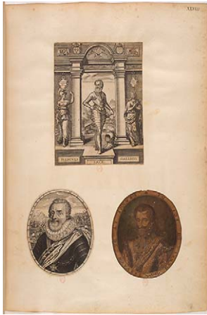
FIGURE 2. Jean Pierre Imbert Châtre, S[ieu]r de Cangé, Estampes du Roy Henry IV, recueillies par J. P.G. Châtre, Sr de Cangé (n.p., 1726), fol. 34. Bibliothèque nationale de France, Paris.

engravings, primarily portraits and the occasional scene (fig. 2). 27 The scenes do not represent all the significant events in the king's life or reign; as a biographical or political narrative, the collection's illustration is strikingly incomplete. This may simply have been an effect of which prints the collector could get or, alternatively and more likely, of his overriding interest in portraits. Châtre de Cangé's compilation was a highly specialized example of print collections dedicated to portraits—portraiture often formed the largest and most important category in more comprehensive print collections. Portraiture bore a special relation to history, since for centuries it had been the primary figurative evidence of the past accessible to writers, evidence that included portraits engraved on coins and medals. 28 Portraits were one of the oldest embodiments of history: figurative representatives of eras or reigns were incorporated early on into manuscripts, published anthologies, or galleries of rulers and distinguished figures, and, in historical narratives, famous personages were increasingly portrayed as actors or agents of history. Visual portraits served as prompts for oral recitations or recollections of past events, and there are documented cases of young members of ruling elites still being taught ancient history and French history in this manner during the eighteenth century. 29