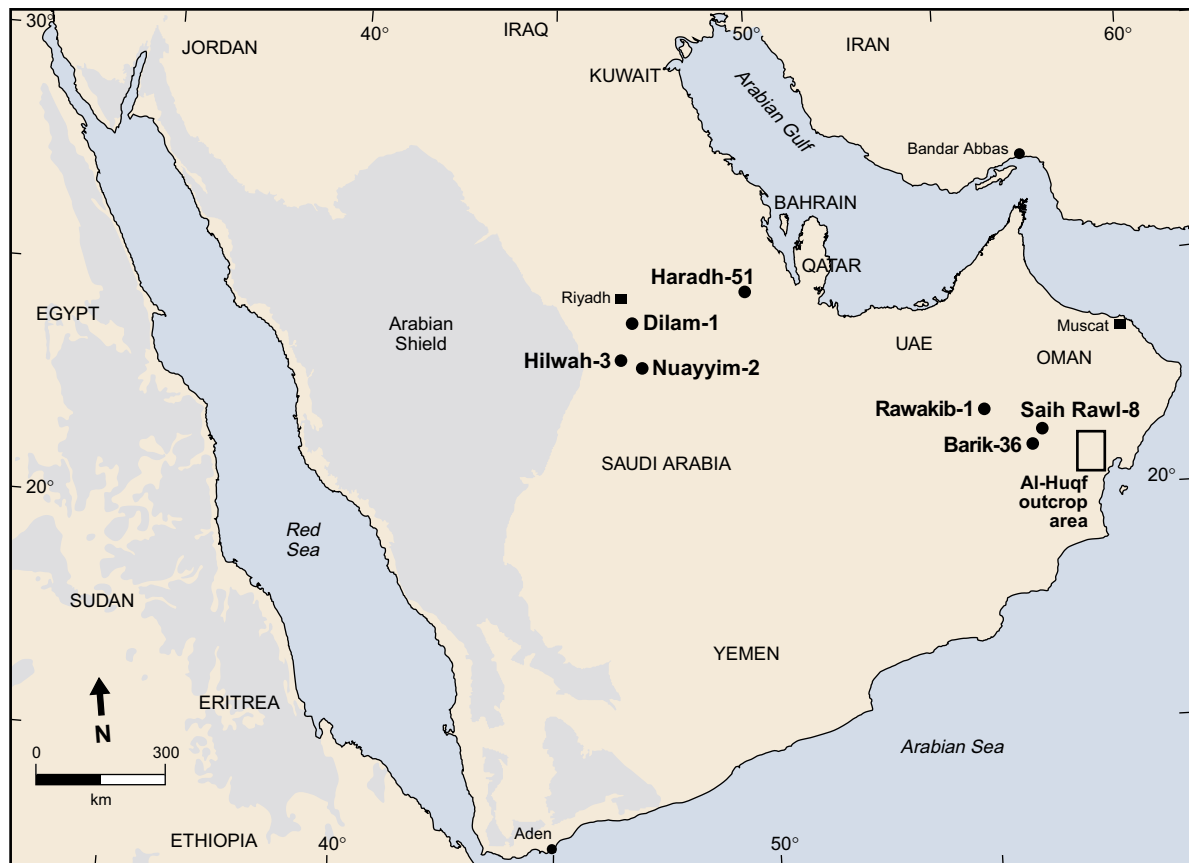
Figure 1: Location of wells and outcrop sections referred to in the text.

In 2003, the exact stratigraphic relationships between OSPZ4, 5 and 6 were not clear because in no section were the biozones seen to be in contact with one another. For example, core samples from the OSPZ5 reference section from 9,029.5–9,062.5 ft (2,752–2,762 m) in Saih Rawl-8 well in northcentral Oman could not be related to OSPZ4 or 6 in the same well because the corresponding intervals were not cored. To express this uncertainty, the bases of OSPZ5 and 6 were represented by dashed lines in figure 2 of Stephenson et al. (2003).