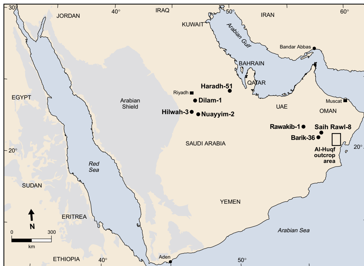
Figure 1: Location of wells and outcrop sections referred to in the text.

In 2003, the exact stratigraphic relationships between OSPZ4, 5 and 6 were not clear because in no section were the biozones seen to be in contact with one another. For example, core samples from the OSPZ5 reference section from 9,029.5–9,062.5 ft (2,752–2,762 m) in Saih Rawl-8 well in northcentral Oman could not be related to OSPZ4 or 6 in the same well because the corresponding intervals were not cored. To express this uncertainty, the bases of OSPZ5 and 6 were represented by dashed lines in figure 2 of Stephenson et al. (2003).