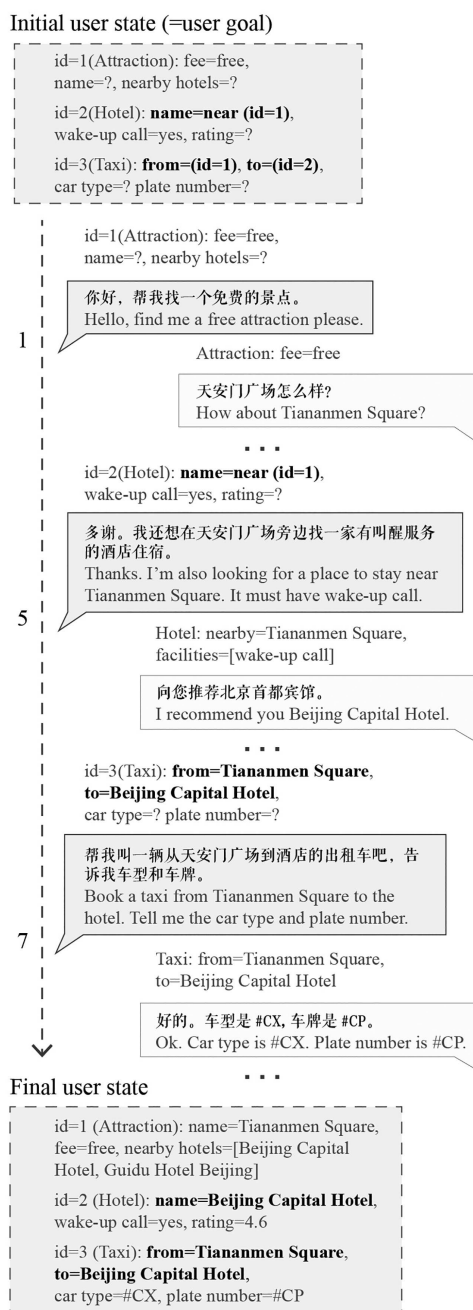
Figure 1: A dialogue example. The user state is initialized by the user goal: Finding an attraction and one of its nearby hotels, then booking a taxi to commute between these two places. In addition to expressing pre-specified informable slots and filling in requestable slots, users need to consider and modify cross-domain informable slots ( bold ) that vary through conversation. We only show a few turns (turn number on the left), each with either user or system state of the current domain, which are shown above each utterance.

According to whether the dialogue agent is human or machine, we can group the collection methods of existing task-oriented dialogue datasets into three categories. The first one is human-to-human dialogues. One of the earliest and well-known is the ATIS dataset (Hemphill et al., 1990) used this setting, followed by El Asri et al. (2017), Eric et al. (2017), Wen et al. (2017), Lewis et al. (2017), Wei et al. (2018), and Budzianowski et al. (2018b). Though this setting requires many human efforts, it can collect natural and diverse dialogues. The second one is human-to-machine dialogues, which need a ready dialogue system to converse with humans. The famous Dialogue State Tracking Challenges provided a set of human-to-machine dialogue data (Williams et al., 2013; Henderson