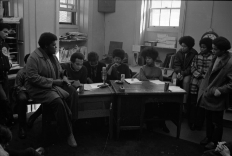
FIG. 4.—A group of African American students present their demands at a press conference during the occupation of four buildings on the Amherst College campus (1970).

Early Wednesday morning on 18 February 1970, over 200 African American student activists, both men and women (Figure 4), from the Five Colleges displayed strength and union by occupying four academic buildings on the Amherst College campus: Converse Hall, Amherst Science Center, College Hall, and the Robert Frost Library. According to Porter, students seized the buildings with ease. In Converse Hall and College Hall, student activists had remained hidden inside until campus police locked them. As part of the occupation, some activists removed books from Frost Library, an ironic action meant to “focus attention upon the unresponsiveness of the white community to the needs of black folk.” 82 A year earlier, the college had promised to establish a library in the Black Culture Center filled with material authored by or focused on African Americans. The removal of books from the library, which student activists renamed Malcolm X Library, highlighted students’ intellectual hunger and the need for a relevant education.