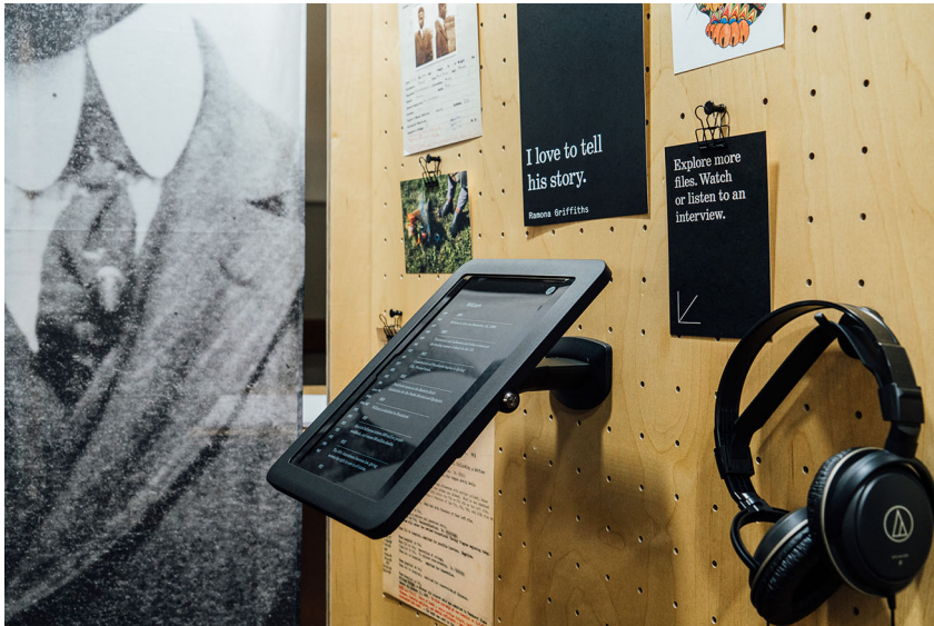
Tablets and headphones that enabled visitors to engage with File/Life content in different ways.