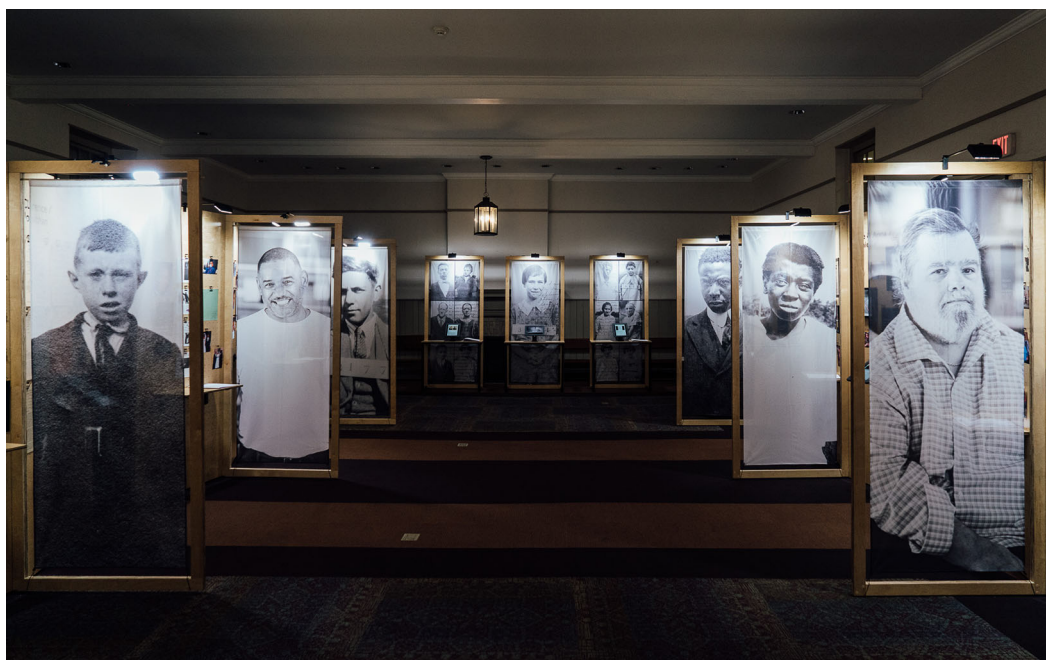
Panels depicting portraits of some of the people who lived at Pennhurst featured in File/Life .

The first room showcased introductory material and stories about several people who had lived at Pennhurst. The community archivists used first names only because, as they explained in the exhibition, “most of the stories told in FILE/LIFE are of people who are no longer living,” which means that “we cannot ask them if they would want to be represented in our work.” They also used first names only “out of respect for any descendants who may still be living.” 11 Each profile included a summary of what we know about these individuals based on their institutional file. Primary sources documented their family history, what kind of medical diagnoses they had, what skills they had and what hobbies they cultivated, the things they did to defy Pennhurst staff and ableism more generally, how they interacted with other people, and more. 12 Profiles also included reproductions of primary sources associated with each individual as well as multiple ways to access the material (tablets, Braille, recordings on headsets, etc.). It would have been more engrossing to view original documents and artifacts, but since exhibition collaborators wanted, understandably, to redact personally identifiable information, this was not possible. 13