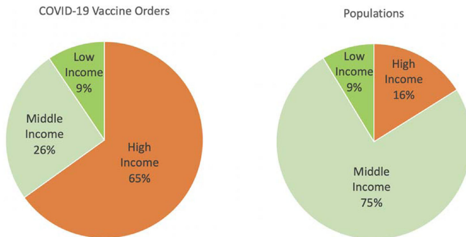
Figure 2. Global distribution of COVID-19 direct orders vs populations. Calculations were made using 2019 population figures released by the World Bank and the numbers of confirmed vaccine purchases published by The Duke Global Health Innovation Center.

workforce. Which countries should get the vaccines first? There are two schools of thoughts on the fair distribution of vaccines, namely equality and equity. Equality means each country should receive a number of vaccines proportional to the size of its population. Equity means vaccines should be allocated based on need. At the moment, there is a patchwork of different pathways for countries to access newly developed COVID-19 vaccines, including direct purchase, group financing and donations.