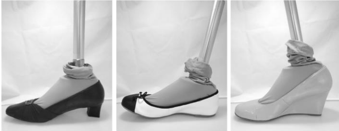
FIGURE 1: A PROSTHETIC FOOT ALIGNED FOR ONE PARTICULAR HEEL RISE (LEFT) IS INHERENTLY MISALIGNED WHEN WEARING SHOES OF OTHER HEEL RISES, AS DEMONSTRATED BY THE ANGLE OF THE RESPECTIVE PYLONS (CENTER, RIGHT).

limited tolerance of footwear with different heel rises. One challenge of these products is that the hydraulic damping range of motion results in an inherent loss of energy because that displacement is not recovered during unloading leading to reduced energy return relative to traditional non-accommodating feet of similar design.