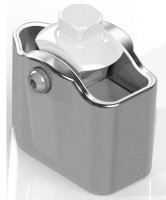
FIGURE 4: THE NOVEL ENDOSKELETAL ANKLE UNIT.

The ankle design volume was the common (intersection) space between the two extreme foot heel rises of 22cm SACH prosthetic feet (10mm heel rise and 89 mm heel rise). Use of 22cm feet to define the design volume supports developing feet for shoes as small as women's size 5 (US). The feet were scanned and overlaid in Geomagic Freeform (3dsystems, Rock Hill, SC). The intersecting volume was used as the design volume.