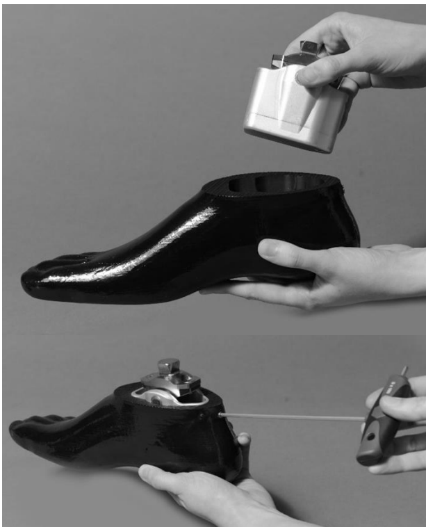
FIGURE 2: THE NOVEL ENDOSKELETAL ANKLE UNIT WITH A STANDARD 10MM HEEL RISE FOOT. A SINGLE SET SCREW AT THE TOP OF THE HEEL LOCKS THE ANKLE UNIT INTO THE FOOT.

With the mechanical and manufacturing complexity contained within the ankle unit (retained with the prosthesis), the foot structure can be low cost and be purchased with the appropriate plantar configuration for each pair of shoes. The requisite foot (sans ankle unit) is inserted into the appropriate shoe and, once settled in place, can remain there as long as desired. When the wearer wishes to don or doff the shoe, they also don or doff the custom-fit foot, with an accessible connector.