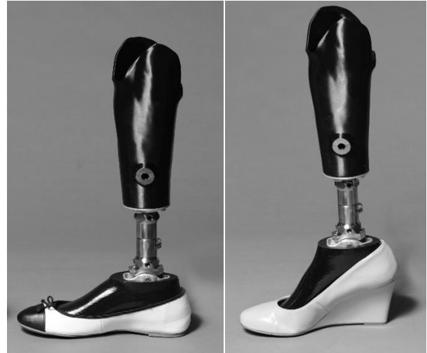
FIGURE 3: THE NOVEL ANKLE UNIT QUALITATIVELY DEMONSTRATES ALIGNMENT EQUIVALENCE WITH CUSTOMIZED FEET. BOTH ANKLE UNITS ARE WITHIN 1 DEGREE OF LEVEL.

With digital customization, the system can achieve equivalent alignment across a broad range of heel rises (Fig. 3).