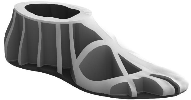
FIGURE 6: CUT-WAY RENDERING OF THE MULTI-BODY DIGITAL FOOT MODEL, SHOWING THE INTERNAL STRUCTURE, EXTERNAL SHELL, AND ANKLE RECEIVER SOCKET.

joined with the main rib to further support the forefoot against mediolateral loading. The external shell was 1mm in thickness to provide a smooth surface for cosmetic purposes but was not intended to provide structural support. The ankle receiver socket was subtracted from the central oval of the internal structure and was designed to match the external geometry of the ankle unit with a small amount of clearance to avoid binding.