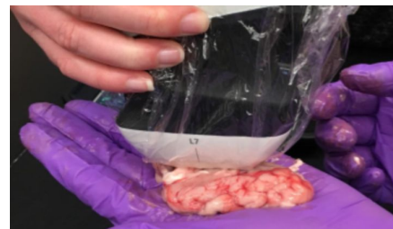
Figure 1: Pig brain used for ultrasound testing