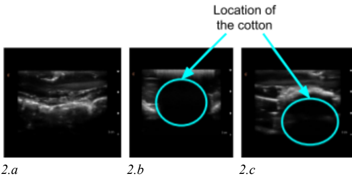
2.a 2.b 2.c Figure 2: Ultrasound scans of pig brain (2.a), pig brain with cotton the surface (2.b), pig brain with cotton 2cm deep (2.c)

Preliminary experiments have been performed using an ultrasound device to detect cotton within a pig brain ( fig. 1 ). First, the pig brain was scanned for a control image ( fig. 2a ). A ~3cm diameter cotton ball was then wedged into a sulcus on the surface of the pig brain and the probe was used to capture an image ( fig. 2b ). This was repeated with cotton underneath the brain and similar results were found ( fig. 2c ). These results are very promising as they show a distinct dark spot where there was cotton. This experiment shows that cotton and brain matter respond to different acoustic frequencies and appear as differentiable materials to an ultrasound device.