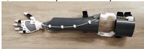
FIGURE 2: ADL ARM V1

The hand TD is voluntary closing. Each digit is restored to its resting position by an elastic element. Notable features of the design are the under-actuation mechanism, which facilitates adaptive grasp; the rotating thumb mechanism, which allows adduction and abduction of the thumb; and the rotating wrist mechanism, which allows pronation and supination of the TD.