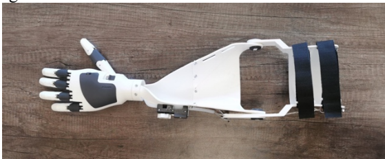
FIGURE 5: ADL ARM V2

Unlike prototype one, the final prototype implements a cable-lock mechanism. This is advantageous as the device is voluntary closing, implying that elbow flexion must be maintained to keep a grip on the object. A cable lock maintains the grip on an object without requiring sustained physical effort from the user. With a cable lock, objects can be grasped away from the body, increasing an amputee's functional work envelope when wearing the device.