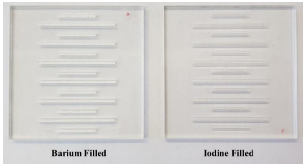
FIGURE 1: Radiopaque scale design with filled with two separate agents.

The scale was designed using SolidWorks® (Dassault Systems, Waltham USA) and was manufactured using clear Perspex®. The dimensions of the scale were 100mmx100mmx3mm. The linear measurement markers on the scale surface were made by drilling 1.5mm deep grooves, at 10mm from each other. The grooves were filled with radiopaque agents such as barium sulfate powder and ICA (Figure 1). The scale was then covered with a ConTract® self-adhesive transparent plastic to reduce spillage. The barium and the iodine were obtained from the radiology imaging facility at the University of Cape Town Private Hospital, South Africa.