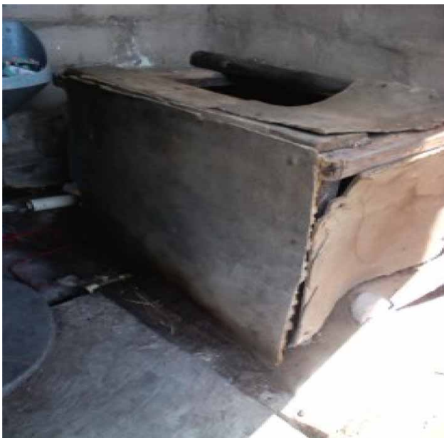
Figure 2 | UDDT seat repaired inappropriately.

The door broke a few months after the toilets were installed...the seats are unstable because they are weak. We have people who are big physically. (Female interviewee)