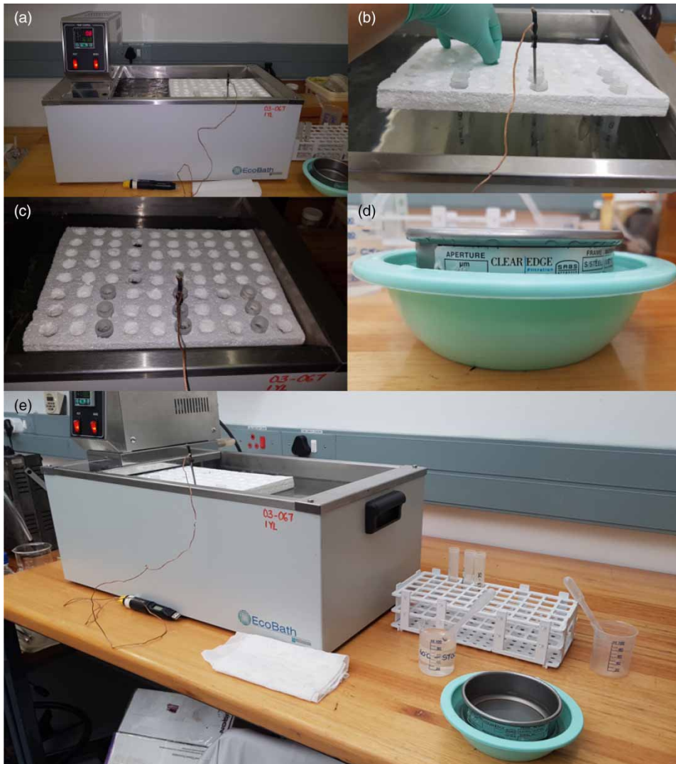
Figure 1 | Experimental setup for heat treatment. (a) and (e) Preheated water bath with polystyrene racks containing test tubes and thermocouple. (b) and (c) Polystyrene rack setup with tubes containing water samples with spiked eggs in 15 mL plastic test tubes. (d) Sieve immersed in tap water, in plastic bowl.

Potentially viable (PV) eggs included those that were undeveloped (at different cell stages), embryonated with a visibly motile larva, and embryonated containing an immobile larva (Naidoo et al. 2016). Non-viable (NV) eggs included those that were dead (globules inside the egg shell), embryonated with a necrotic larva, and mechanically broken (Naidoo et al. 2016). Samples were analysed before and after incubation such that treated samples were immediately analysed, washed back into the test tube after counting, incubated for 28 days at 25 °C and then re-analysed after incubation. This process was repeated for all temperatures and exposure times and for controls. Eggs were further