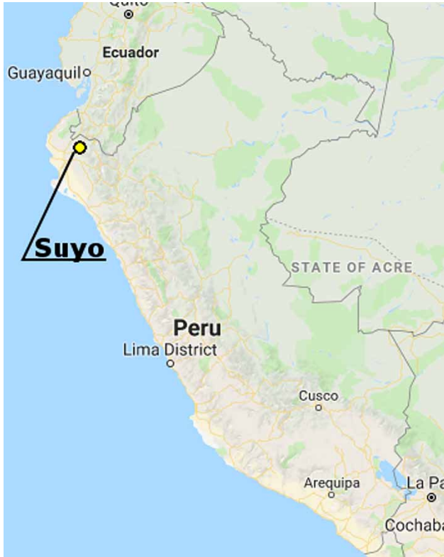
Figure 1 | Demonstration site of Suyo, Peru.

residual (Ries et al. 1992). The city of Trujillo had no chlorination at all (Swerdlow et al. 1992). The water treatment situation in Peru has greatly improved since 1991 although much improvement is still needed. In 2015, 95% of the Peruvian urban population and 72% of the rural population were using an improved drinking water source (WHO 2016).