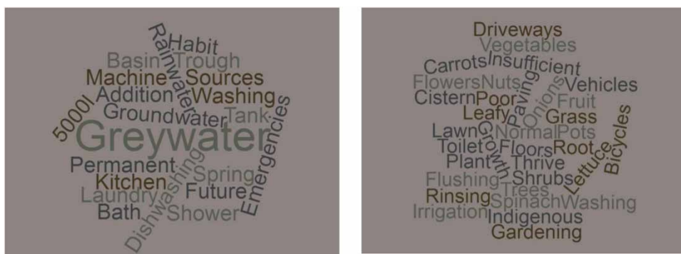
Figure 2 | Cape Town Case Study: greywater sources and end uses word clouds.

In Group A, these greywater sources were mostly used for flushing toilets (74%) and irrigating the garden (57%). Other end uses included washing of driveways and