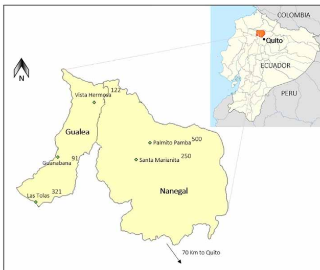
Figure 2 | Map of Gualea and Nanegal districts. Communities studied are marked with the approximate population in superscript.

Eight assays of microbiological efficiency showed reduction values of 5.36 logarithms for E. coli (standard error \pm 0.38 ) and 3.83 logarithms for MS2 bacteriophage (standard error \pm 1.47 ) (Figure 3). Bacteria removal shows similar results to those previously reported by classical CWF studied (van der Laan et al. 2014). The viral removal has higher variability but mean reduction values up to 600 L filtered have increased 2 logarithms compared with the classic