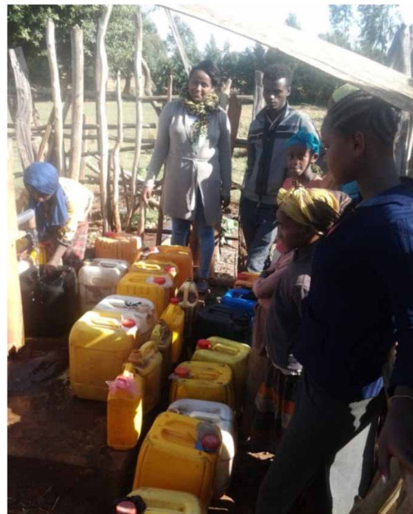
Figure 3 | Queue at the water point.

This factor is found to be a statistically significant ( p < 0.01 ) factor that affects the operational sustainability of RDWPs negatively. The likelihood of sustainability with the occurrence of conflict in the water points is 0.213 lower than those with water points with no incidence of conflict. The marginal effect of this variable is -0.363 , implying that the probability of operational sustainability of water points decreases by 36.3% with the prevalence of conflict in the service points. It was also revealed in FGD that conflicts usually occur during queuing time (line ups of jerry cans as seen in Figure 3) at the water points, particularly in the water points where the number of households using drinking water from the same water points is high. Whenever