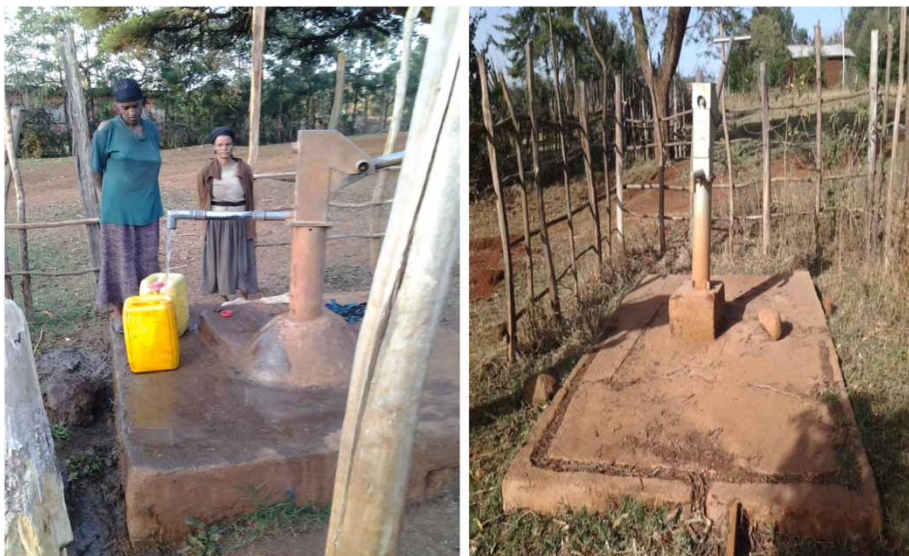
Figure 2 | Functional RDWP (left) and non-functional RDWP (right).

As shown in Table 2, the overall model with chi-square value of 131.61 and a probability of p < 0.000 indicates