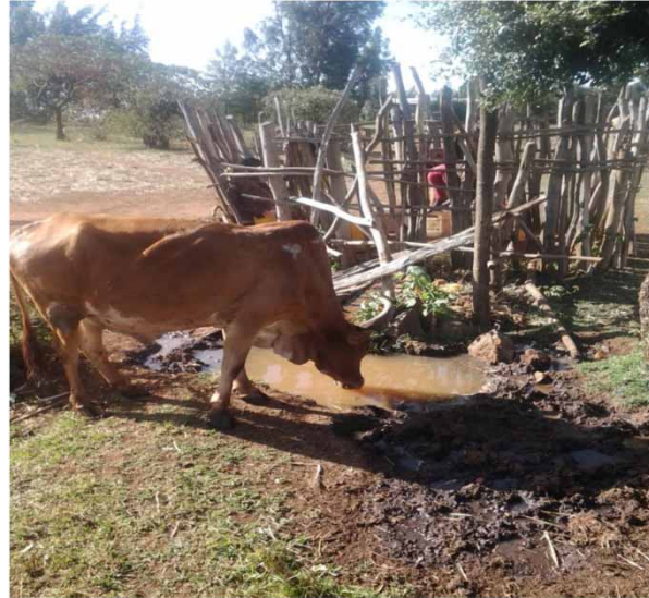
Figure 4 | A cow drinking water around the water point.

As expected, training on maintenance is found to be a statistically significant ( p < 0.05 ) factor that affects operational sustainability of RDWPs positively with odds ratio of 6.143. The odds ratio result indicates that the likelihood of sustainability increases by 6.143 when users are trained on maintenance of the water points. In terms of percentage, the probability of sustainability increases by 42.5% when