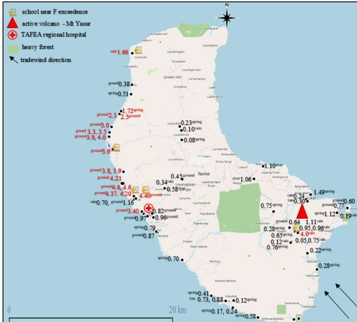
Figure 2 | Fluoride concentrations in drinking water samples (mg/L) collected across Tanna Island, Vanuatu 2017–2020. Results in red denote exceedance of WHO upper fluoride limit of 1.5 mg/L. Please refer to the online version of this paper to see this figure in colour: http://dx.doi.org/10.2166/washdev.2021.270 .

Twenty-three drinking-water samples, across Tanna, exceeded Vanuatu's upper limit of 1.5 mg/L F (Table 1). Twenty-six of the 30 groundwater samples were located in West Tanna (Supplementary Material, Table S1), an area that includes the main business area of Lenakel, markets of Blakman Town, the regional hospital, multiple primary schools, kindergartens and a large area high school. Groundwater results from West Tanna show a defined pattern of fluoride concentrations: lower in the north and south with higher yields in the centre of the western coast.