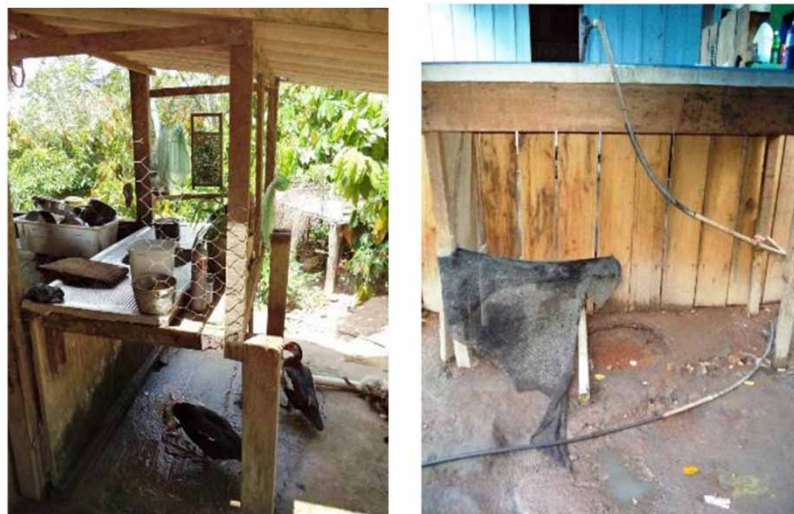
Figure 2 | Household jiraus with wastewater disposal.

Due to several obstacles to the work (not reduced work, lack of material and delays), the dimensions of the bathroom were below what many wanted, contrary to the expectations of those interviewed. ‘... What we wanted was a bigger bathroom, which could be shared, a place to bathe on one side and the toilet on the other. We also asked for a shower, they didn’t want to do it ’.