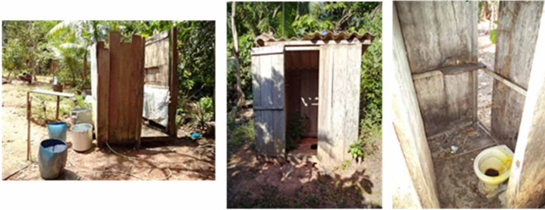
Figure 3 | Improvised unit for bathing, 'sanitary', and dry pit with toilet.

After the construction of the bathrooms, the fulfilment of the physiological needs and the bath became more comfortable for the interviewees' unanimity. However, when they are away from home, some children still use the river to defaecate and urinate, as they prefer not to travel long distances just to meet these needs. When they are carrying out agriculture and fishing, adults choose to use the bush to defaecate and urinate.