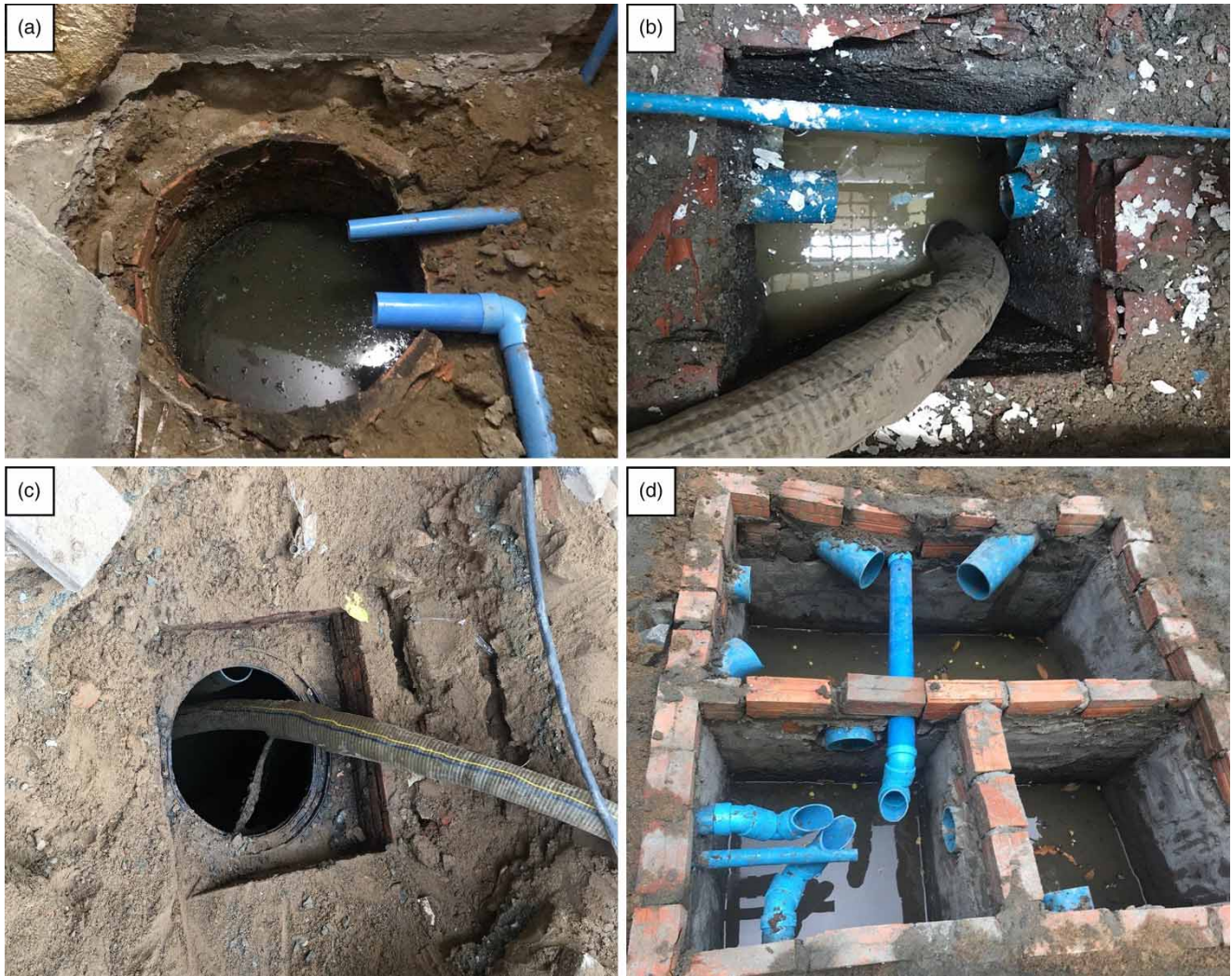
Figure 1 | Typical (a) circular and (b) rectangular cesspits and (c) imported plastic and (d) rectangular brick septic tanks used by households in Phnom Penh. Please refer to the online version of this paper to see this figure in colour: http://dx.doi.org/10.2166/washdev.2021.193 .

consists of two or three chambers, with the first chamber receiving everything from the toilet. The supernatant then flows to the next chamber. The supernatant from the last chamber can flow freely to the urban drainage network if it is located within the drainage coverage area. Septic tanks made from plastic are normally imported from Thailand or China. Circular or rectangular cesspits, another onsite sanitation technology, are also commonly used in the city. The circular type is made by assembling two to six pre-cast concrete rings. The rectangular system is similar to a septic tank, but has only one chamber (Figure 1). Residents in Phnom Penh commonly use both auto-flush and pour-flush toilets. Since piped water distribution has almost a full coverage, householders use water for anal cleansing/washing, whereas tissue paper is only used by a small proportion of the population.