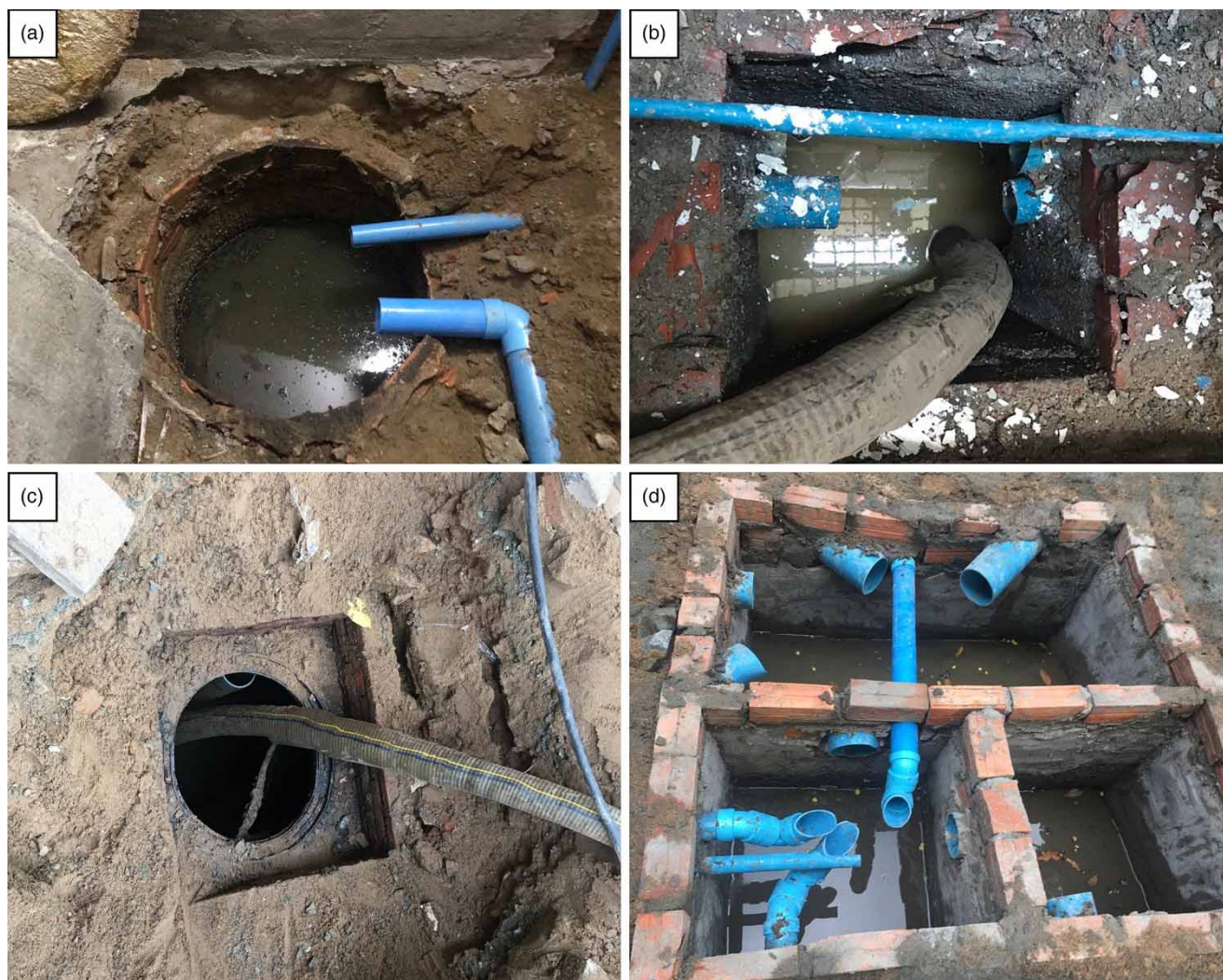
Figure 1 | Typical (a) circular and (b) rectangular cesspits and (c) imported plastic and (d) rectangular brick septic tanks used by households in Phnom Penh. Please refer to the online version of this paper to see this figure in colour: http://dx.doi.org/10.2166/washdev.2021.193 .

consists of two or three chambers, with the first chamber receiving everything from the toilet. The supernatant then flows to the next chamber. The supernatant from the last chamber can flow freely to the urban drainage network if it is located within the drainage coverage area. Septic tanks made from plastic are normally imported from Thailand or China. Circular or rectangular cesspits, another onsite sanitation technology, are also commonly used in the city. The circular type is made by assembling two to six pre-cast concrete rings. The rectangular system is similar to a septic tank, but has only one chamber (Figure 1). Residents in Phnom Penh commonly use both auto-flush and pour-flush toilets. Since piped water distribution has almost a full coverage, householders use water for anal cleansing/washing, whereas tissue paper is only used by a small proportion of the population.