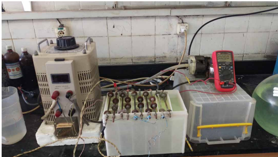
Figure 1 | Set up of the electrocoagulation (EC) cell unit consisted of stainless steel plate electrodes, DC power supply, voltmeter, electric pump, cables and electrolyte.

where one row is connected with anode and the other is connected with cathode. The distance between the electrodes was 2 cm each. The set of electrodes was submerged into the examined electroplating wastewater. This system was designed to determine the released coagulant and the bubble type, thereby influencing flotation, mixing, mass transfer and metal removal. It is worth mentioning that flotation is a major separation mode, therefore, electrolytic bubbles production is required.