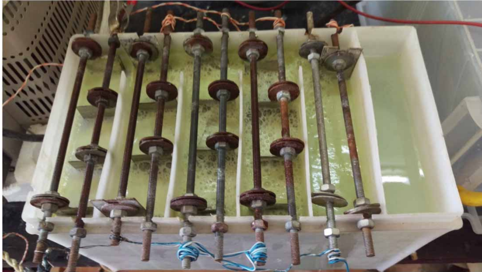
Figure 2 | set up (surface view) of electrocoagulation treatment cell for electroplating wastewater effluent.