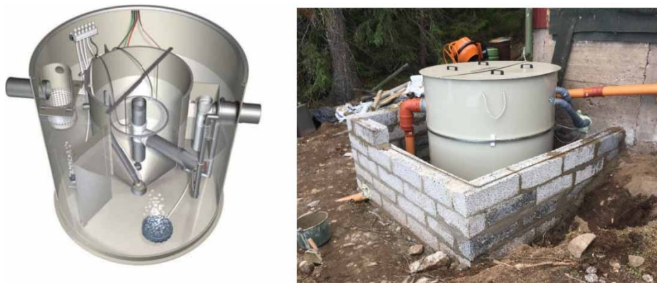
Figure 1 | The BioCleaner process and the current installation.

The water recovery process is a commercial system BioCleaner (Envi-Pur 2023) designed as a pre-denitrification system for nutrient removal (Chen et al. 2020). The treatment system is contained in a plastic tank with a 1.6-m diameter built into a small housing made of hollow concrete blocks (Figure 1). The process is designed for one household (up to 5-person equivalents, pe), but there are commercial units up to 50 pe. Insulation is complemented with 10 cm plastic foam blocks. The walls provide heat insulation, so the microorganisms can be maintained at an appropriate temperature. The unit is a complete mini wastewater treatment unit, built in sections. The BioCleaner process has been installed in several hundred places and has been approved by regulatory authorities. Notably, the process manufacturer has not before connected to this system with solar energy.