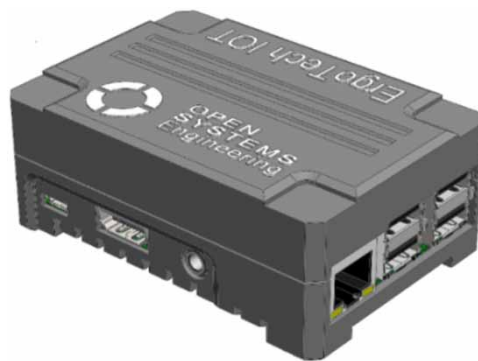
Figure 4 | A control unit, produced in a 3D printer, based on Raspberry Pi.