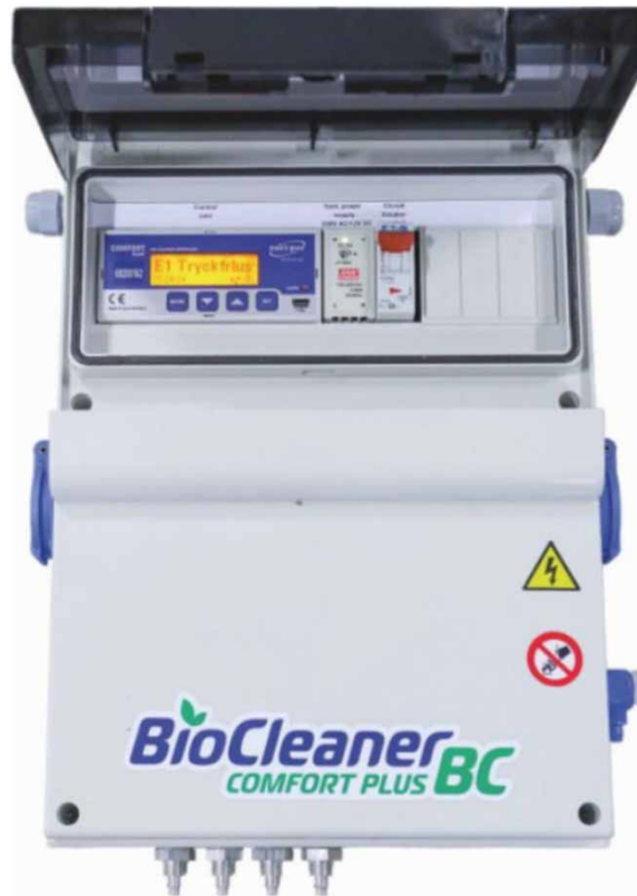
Figure 3 | The commercial control unit for the airflow valves, driven by 24 V DC.