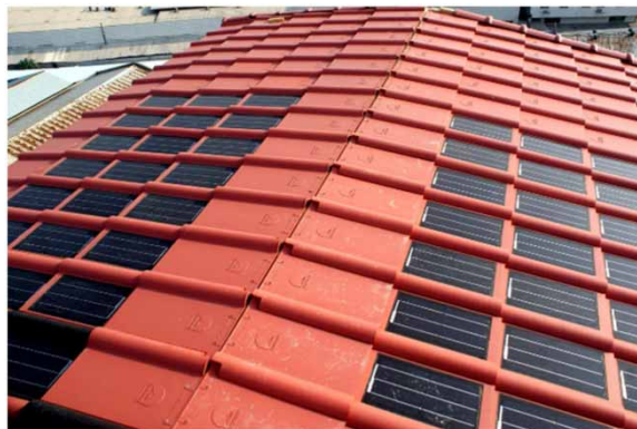
Figure 2 | Roof with solar panels and thermal power generation.

The whole system is driven by a solar-powered unit. The solar PV panels are designed as regular roof tiles using a 3D printer (Figure 2). This provides around 120 \text{ W/m}^2 and 24 VDC. The electric power consumption is about 60 W (depending on the influent load), so only a few roof tiles are required for power generation.