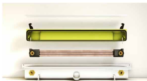
Figure 5 | The shower floor heat recuperation system.

A heat pump is an important and integrated part of the total system. Excess electric energy can be converted to heat in an air/water heat pump. The heat pump can control the water to the desired temperature. The next phase of the project is to control the antifreeze water flow rate based on the heat flow using a variable speed pump, powered by solar PV. The heat flow is led through a newly designed heat exchanger that operates like a heat flow sensor with a very short time constant (Figure 5). The initial purpose of the heat exchanger has been to recover heat from warm water in showers. This heat sensor makes it possible to dynamically control the heated water flow, providing the biological processes with sufficient and adequate heat energy.