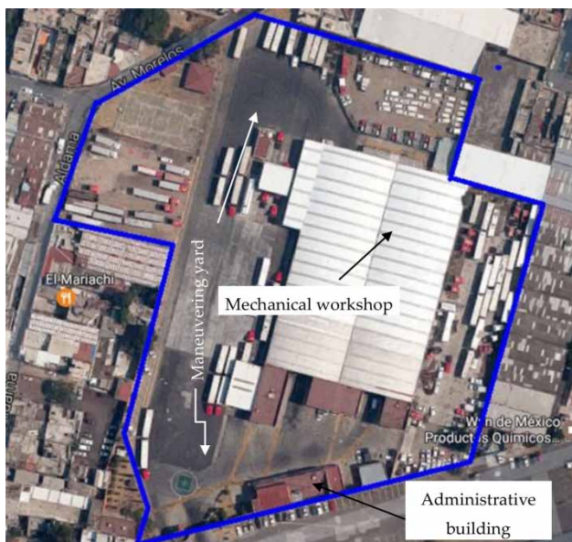
Figure 1 | Catchment surfaces of buildings and maneuvering yard.

Rainfall was determined based on meteorological data collected from the nearest climatological station (No. 15059