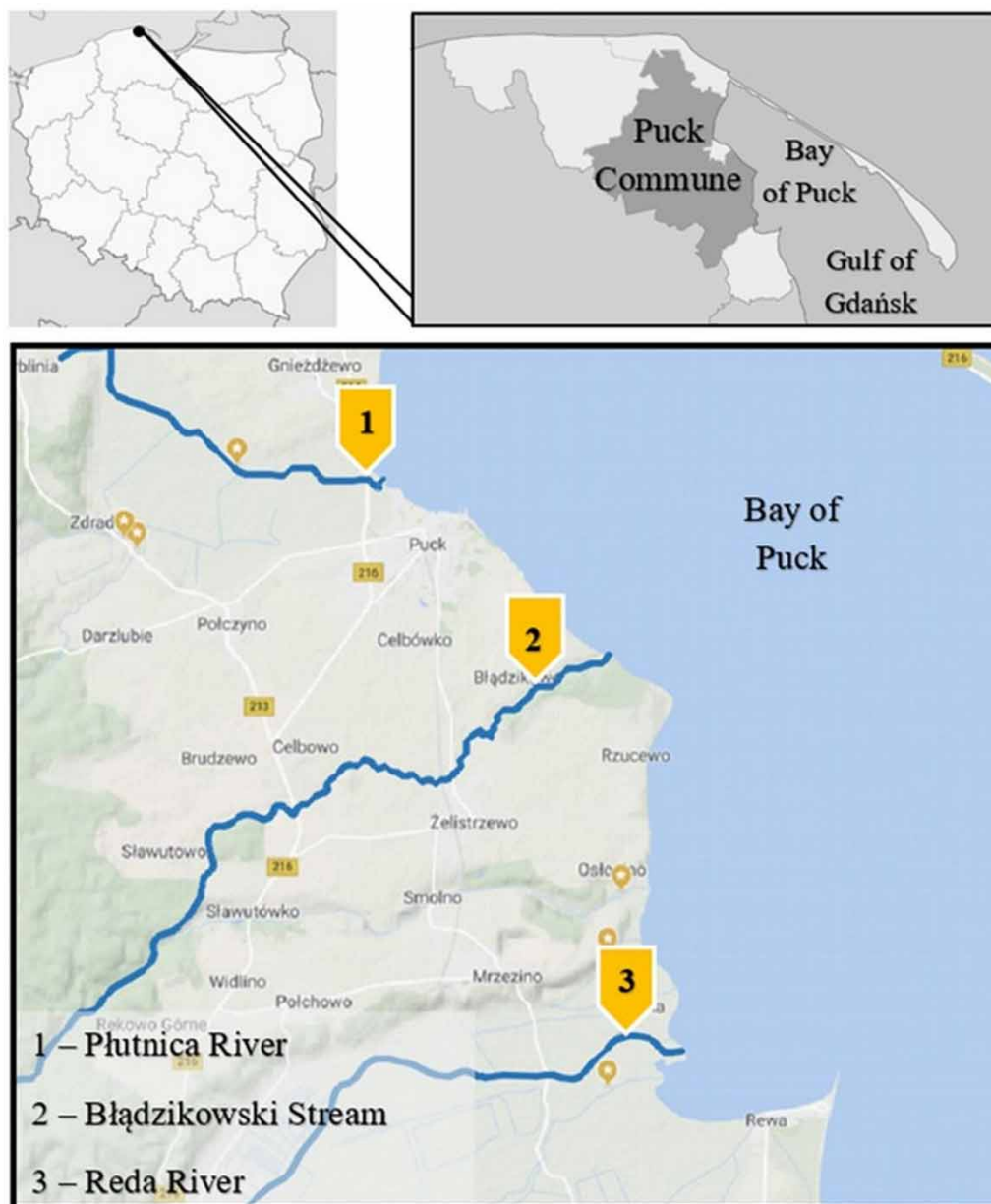
Figure 1 | Puck Municipality and location of measurement points (1–3) on analysed watercourses: Płutnica River, Bładzikowski Stream and Reda River.

were taken from the middle stream course using a sampler with an extension arm. The following analyses were performed: ammonium nitrogen ( \text{N-NH}_4 ), nitrite nitrogen ( \text{N-NO}_2 ), nitrate (V) nitrogen ( \text{N-NO}_3 ), total nitrogen (TN), phosphorus phosphate ( \text{P-PO}_4 ) and total phosphorus (TP). The determinations were carried out according to Polish Standards compatible with EU and US-EPA standards, immediately after the samples were