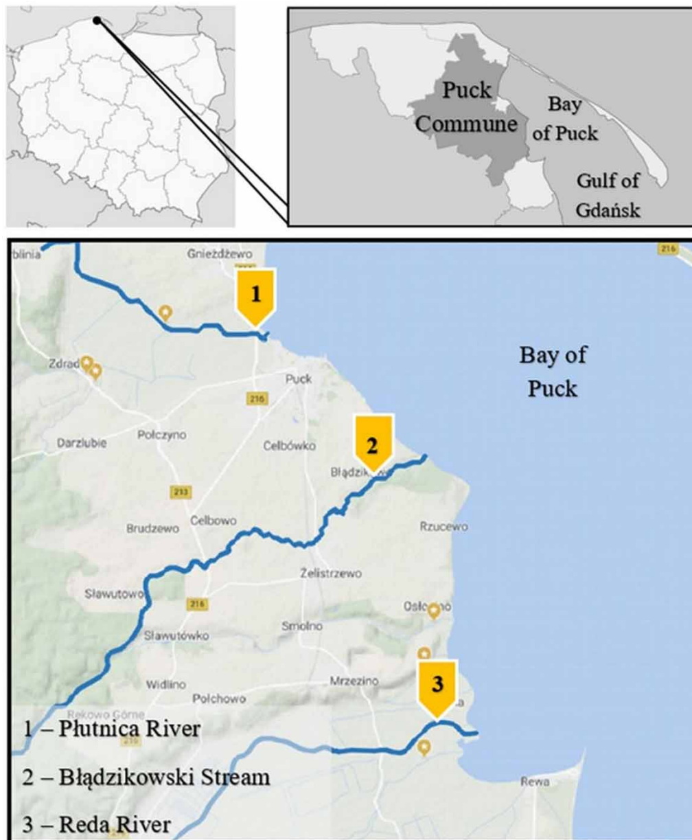
Figure 1 | Puck Municipality and location of measurement points (1–3) on analysed watercourses: Płutnica River, Bładzikowski Stream and Reda River.

were taken from the middle stream course using a sampler with an extension arm. The following analyses were performed: ammonium nitrogen ( \text{N-NH}_4 ), nitrite nitrogen ( \text{N-NO}_2 ), nitrate (V) nitrogen ( \text{N-NO}_3 ), total nitrogen (TN), phosphorus phosphate ( \text{P-PO}_4 ) and total phosphorus (TP). The determinations were carried out according to Polish Standards compatible with EU and US-EPA standards, immediately after the samples were