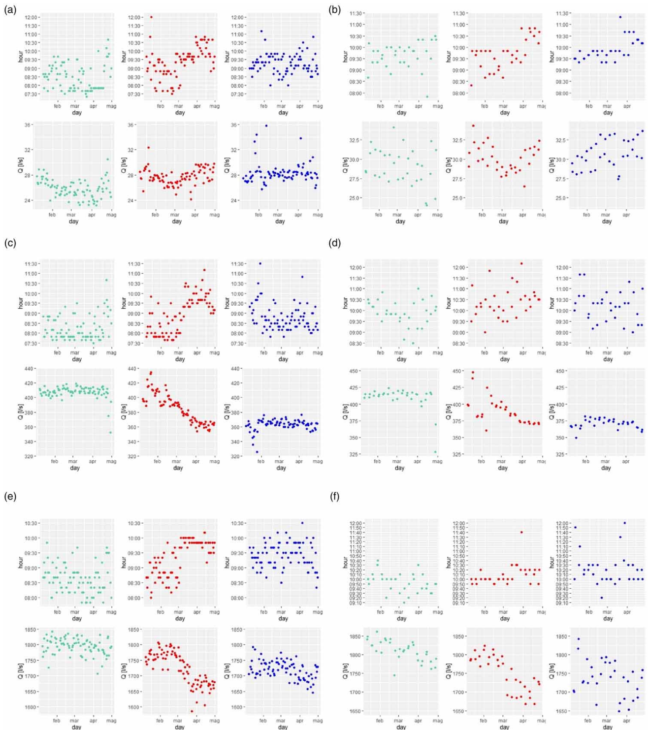
Figure 3 | Time and peak values related to the period January–May of 2019 (green), 2020 (red), and 2021 (blue) on (a) weekdays and (b) weekends for Town 2, on (c) weekdays and (d) weekends for Town 4, and on (e) weekdays and (f) weekends for Town 5.

In addition, it is essential to underline how, in the cited towns, the secondary peak, close to lunchtime between 2 and 4 pm, which was particularly noticeable for town 2 in 2019, disappears entirely in the first lockdown in 2020 and the second in 2021 (Figure 4). The users are all at home, which leads to a redistribution of water consumption over a completely different time interval,