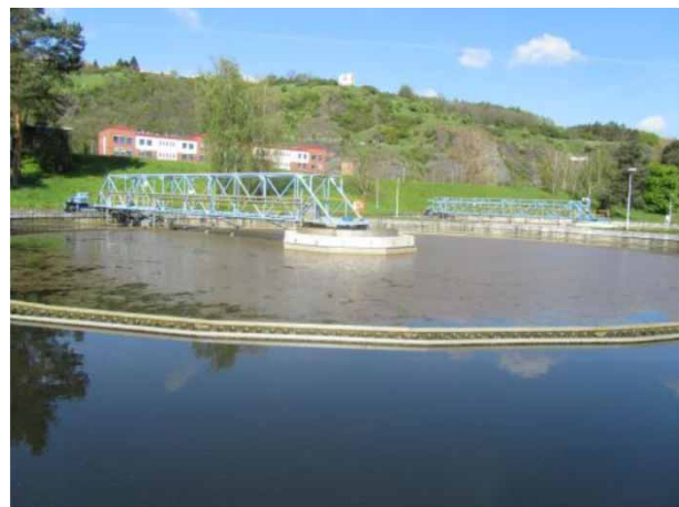
Figure 1 | Secondary clarifier of Prague Central WWTP from the 1960s. Simple energy dissipating well in the center, in-board effluent launder (scum baffles were added later), no surface skimming, sidewall depth 2.5 m.

The secondary clarifiers reached at the turn of the 21st century probably their optimum design and performance based on the development in sedimentation and thickening theory. Even so, secondary clarification is still the limiting factor in