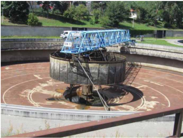
Figure 2 | Secondary clarifier of Prague Central WWTP from 1997. Horizontal flocculation zone, spiral blade sludge scraper, Stamford baffles; sidewall depth 4.4 m.

the design of the whole activated sludge system because of several inherent deficiencies of secondary clarifiers: