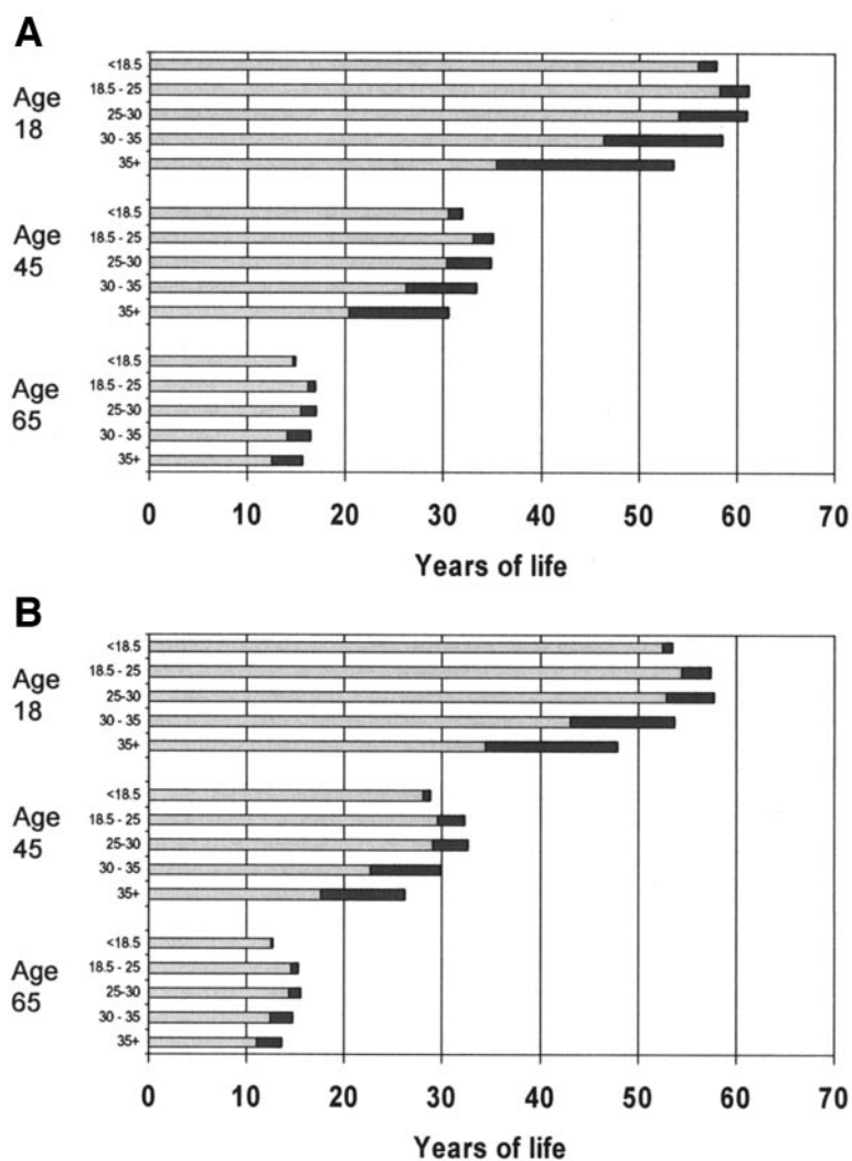
Figure 2 —Average number of years of life remaining with (■) and without (□) diabetes, according to baseline age and BMI among women (A) and men (B).

on mortality for the general population in our estimations. Finally, we have computed remaining lifetime risks based on the BMI at one point in time. BMI, however, generally increases with age until the fifth and sixth decades of life and decreases thereafter (28). Although it is difficult to predict the magnitude and direction of bias attributable to use of a single BMI value, we may have underestimated risk attributable to BMI in our study. In younger adults, a single BMI value may lead to an underestimation of their risk of future diabetes because they will likely continue to gain weight for several decades. For older adults, a single BMI value may also lead to an underestimation of their remaining lifetime risk because it will not reflect the preceding decades of exposure to BMI levels that were likely elevated before experiencing age-related weight loss.