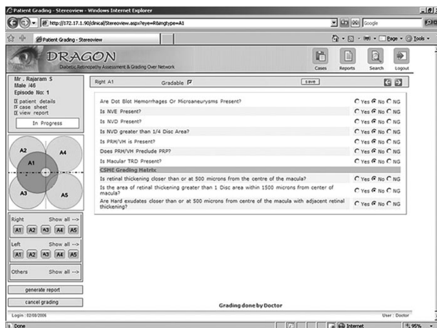
Figure 2 —The ADRES 3.0 data input screen.

At the grading station, Windows-Intel-compatible professional desktops were deployed with a high-end graphics card (3Dlabs oxygen GVXI), 21-inch 100-