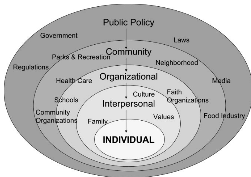
Figure 2 —The socio-ecological framework. Health behaviors of the individual (inner oval) are influenced by interpersonal, organizational, community, and public policy domains represented by the progressively larger ovals. Many influencers span more than one domain.

child's risk of obesity but also on the child's culture and the education level and SES of the child/family. It is important to plot BMI, to show the child/family the plot of BMI over time, and to explain the meaning of BMI, BMI percentile, and upward crossing of percentiles. For health care providers to have a meaningful interaction about energy intake and energy expenditure with children/families, providers should have training in cultural competency in order to understand the specific barriers patients face and the influence of culture and society on health behaviors. Providers should offer anticipatory guidance and give specific information about the health benefits of physical activity and good nutrition and how to diminish sedentary behavior. Motivational interviewing can be used to engage patients and understand barriers to change.